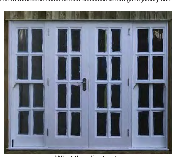
What the client got